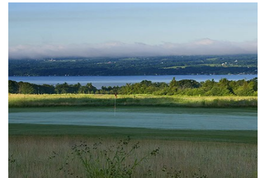
9th Hole overlooking Cayuga Lake